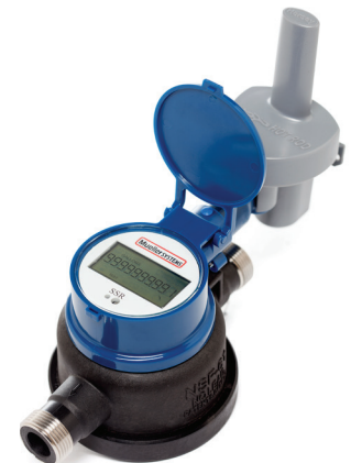
420 Composite PD meter with SSR and integral Hot Rod transmitter

In standard energy-saving mode, the LCD display remains unlit. When a visual meter reading is required, opening the lid triggers the SSR's optical sensor to display its data for 30 seconds, ample time to obtain the meter reading. The Mueller Systems logo and SSR product name identify the register as the latest product in a long line of electronic register devices designed for the reliable transmission of meter data since the early 1960s.