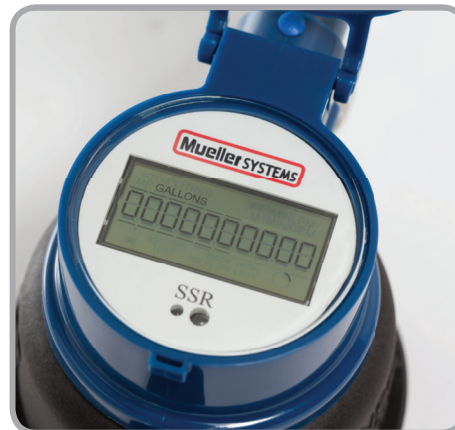
Solid State Register (SSR)§

© 2014 Mueller Systems LLC. All Rights Reserved. The trademarks, logos and service marks displayed in this document are the property of Mueller Systems LLC, its affiliates or other third parties. Any products herein marked with a section symbol ( § ) are subject to patents or patent applications. For details, visit www.mwppat.com . 10/08/2014